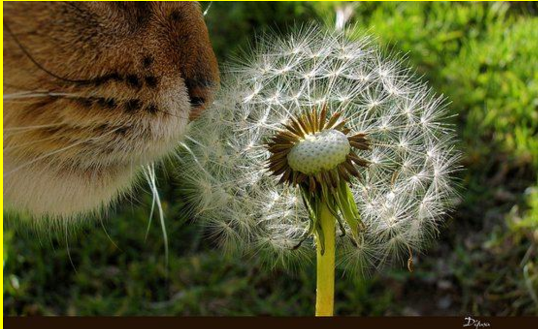
Smell: Cinnamon and Rosemary

We smell the sweet scents emanating from the rosemary and cinnamon, representing what is yet invisible to the eye, still to be born.