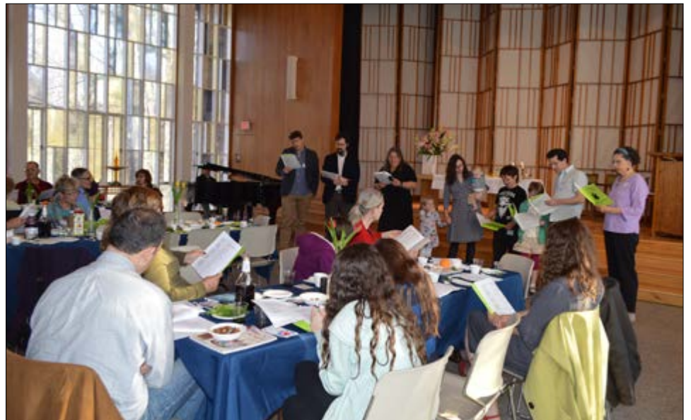
Photos from Machar's annual community Passover Seder on Saturday, April 4.